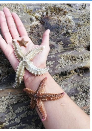
An armful of star fish